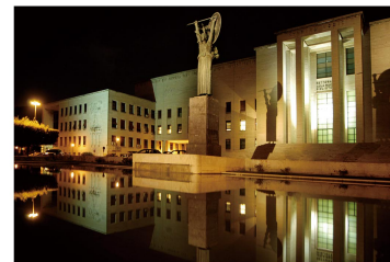
Università di Roma http://en.uniroma1.it/

Sapienza University of Rome, founded in 1303 by Pope Boniface VIII, is one of the oldest extant universities in the world and a high performer among the largest universities in the international rankings.