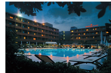
Crowne Plaza Rome-St. Peter's http://www.ihg.com/crowneplaza

Crowne Plaza Rome-St Peter's is only 20 minutes' drive from Fiumicino Airport. Treat yourself to an in-room dining experience at Crowne Plaza Rome-St Peter's & relax on your balcony overlooking the hotel's outdoor pool, tennis courts or gardens. Come to the St Peter's Spa to let off steam in our sauna & Turkish baths, or rest on the loungers around our heated indoor pool.